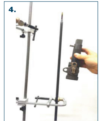
4. Fit new valve.