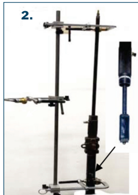
2. Attach Valve Changer and insert stopper below valve.