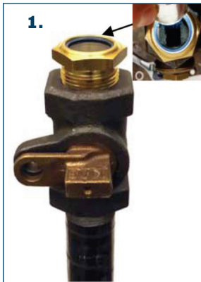
1. Remove piping and check valve passage with sight glass.