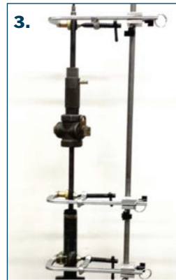
3. Remove old valve.